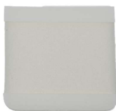
2 strips ivory