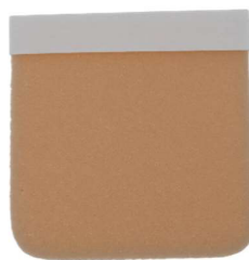
1 strip beige