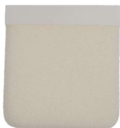
1 strip ivory